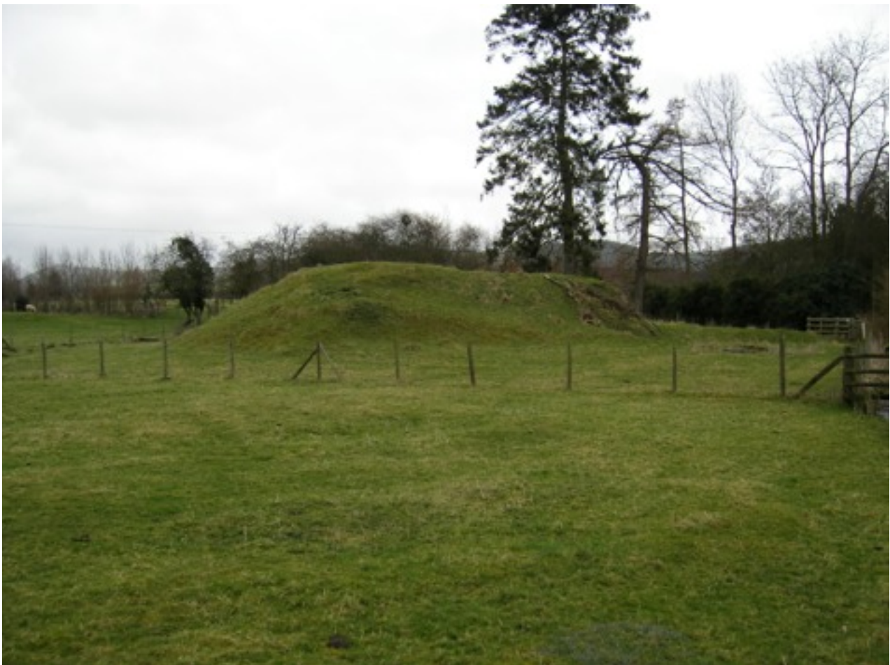
Clungunford motte. Held in 1165 by Simon de Haburdnig for service of a knight's fee castle guard (40 days service) at Clun Castle.

would they do if they saw what they were watching for? Given that much of the area is pretty hilly the viewshed from such towers would be limited and even if a watch was mounted and a band of raiders was seen by some sharp eyed individual (without any optical aids) the time before mounted raiders were upon the site might allow people to get to the tower but would not allow livestock (the target of such raiders) to be secured. It might allow a knight time to get into his armour. The tenurial histories show these sites often mark the farmstead of military men (not always of knightly status many were 'serjeants' usually considered to be less well equipped) but the tenurial histories also show these men usually held these farmstead by the feudal tenure of military service to an overlord often in the form of castle-guard at one of the major royal and aristocratic castles of Shropshire