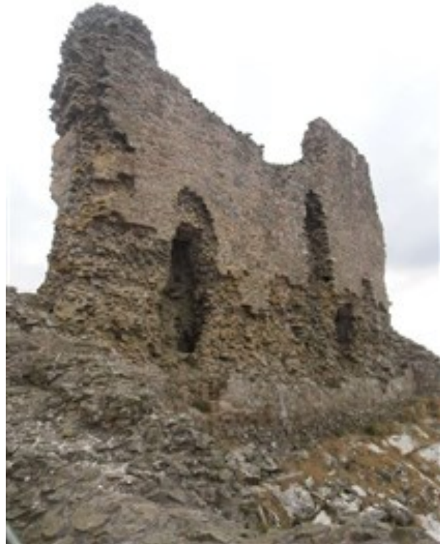
Montgomery Castle. Grade 1 listed

The West Yorkshire Archaeology Advisory Service holds the Historic Environment Records for the 5 unitary authorities (Bradford, Calderdale, Kirklees, Leeds and Wakefield) which were formerly West Yorkshire (A county formed in 1974 which was not the same as the West Riding of Yorkshire). They have added to the Heritage Gateway database online versions of their records and I've added the appropriate links to site web pages. However, as I had