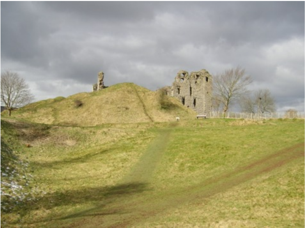
Clun Castle. A baronial castle original built by Picot de Say around 1086.

Most of that 2 months has been spent in a site by site revision of the records for the historic county of Shropshire , some 262 records. This means these record now generally have much fuller descriptions more clearly attributed and are more precisely and accurately located. There are some improvements and updates of the bibliographies with some more links to online copies. Unfortunately there isn't an online scan of the 1908 Victoria County History with the earthworks chapter and other editions with the parish histories for Shropshire are either not online or cover only a very limited area of the county. Therefore I've tried to fill in the gaps in tenurial history by adding links to Eyton's Antiquities of Shropshire . This 12 volume work from the mid 19th century is certainly impressive in scope but not particularly easy to read and, in practice, somewhat limited in usefulness but does give