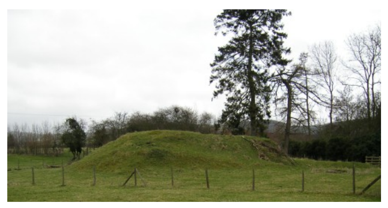
Clungunford Motte, Shropshire

ringwork<sup>3</sup> or, possibly more typically<sup>4</sup>, by adding a motte. The size and height of such castle earthworks does depend on the quality of soil they are made from. In areas with good deep sub-soil it is possible to build large mounds with the simple iron clad wooden spades available with relative ease but in areas with little soil mounds might well be made of piles of river pebbles and boulders